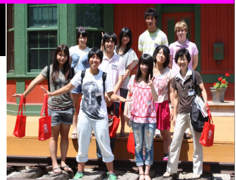
Just being American teenagers.

Look for information on the upcoming Motaku Convention to be held in October.