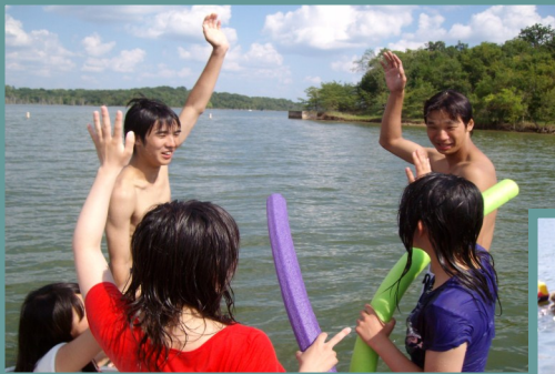
Students join friends in a loved American activity of water fun on Blue Springs Lake, learning the ropes from the Moxley family.